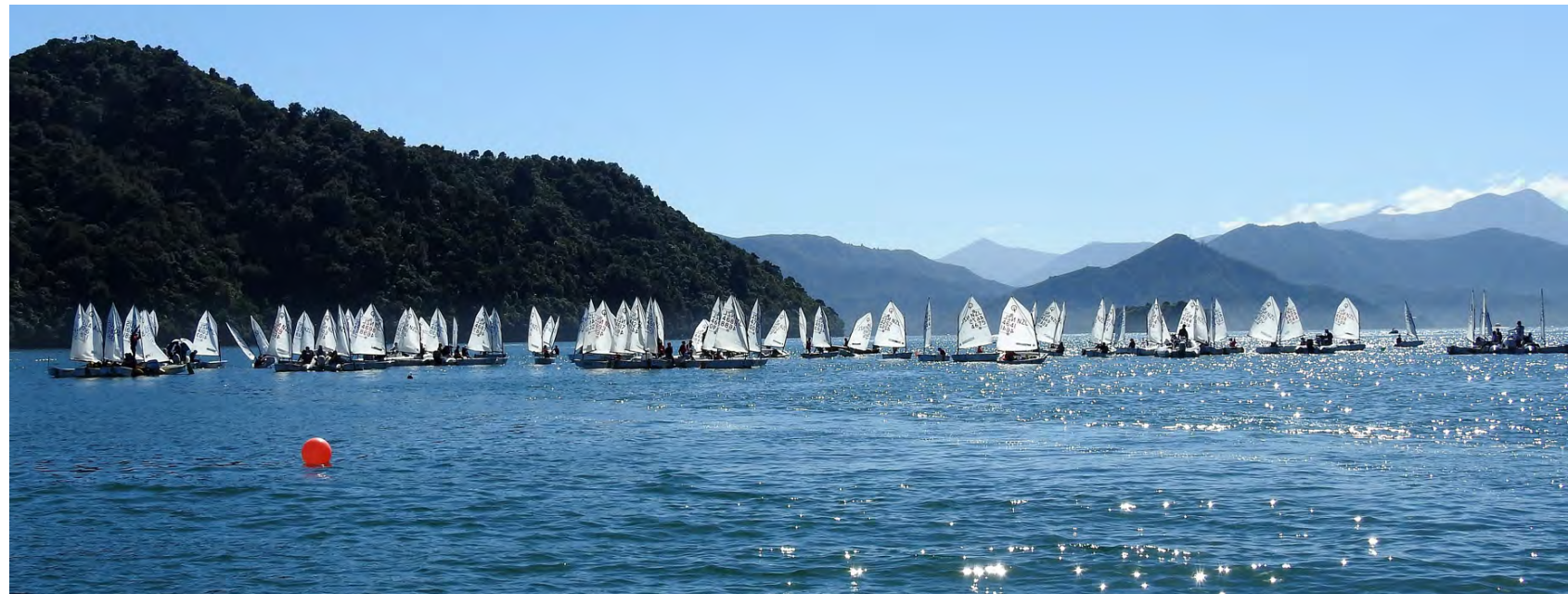
Above: QCYC in the parade