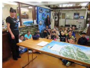
A recent visit from Riverlands School

PICTON HERITAGE & WHALING MUSEUM welcomes visitors, groups or individuals Phone 573-8283 or call in at 9 London Quay