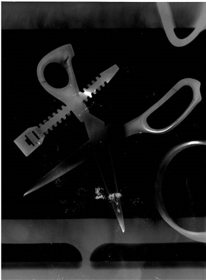
Scissors image showing a strong contrast required to achieve a strong image.

It was quite hard for me to stay still! I kept shaking so my photo came out blurry, which was a shame. But it was really easy to make the camera. We found that if you didn't take your photo in a place with a lot of contrast the picture also wouldn't come out looking good because the light rays weren't bouncing off enough solids to make a decent picture. It was very interesting because we learnt about how photograph taking was like back in the olden days, and it was interesting knowing that the process hasn't left us today, even with all of our technology!