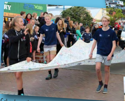
School pupils across Marlborough scribbled messages of support on a sail which QCYC members carried in the parade before it was presented to the team