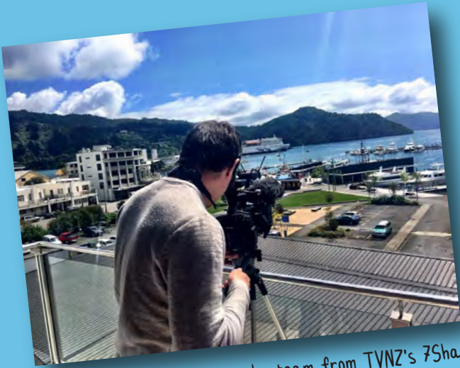
The day started early for the team from TVNZ's 7Sharp