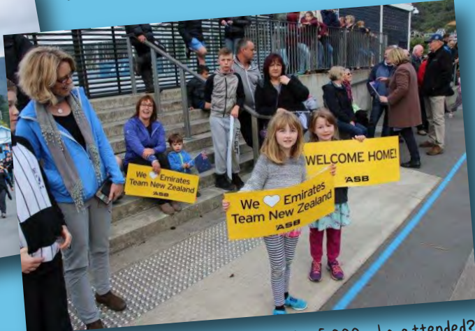
Were you one of the 5,000 who attended?