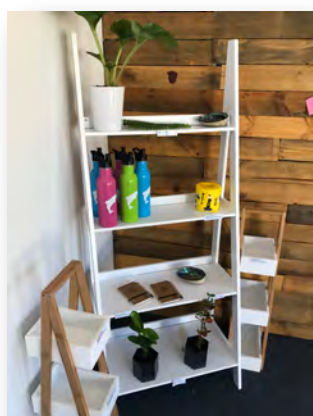
Above: Environmentally friendly products