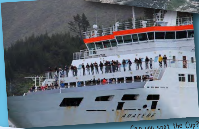
Can you spot the Cup?