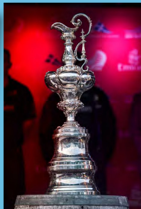
The Auld Mug