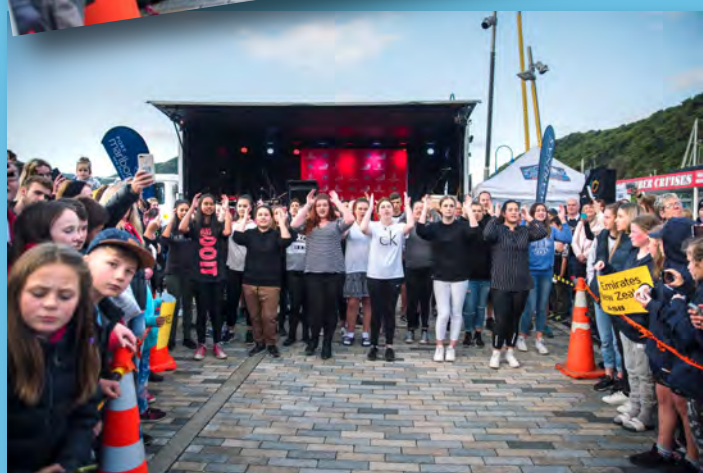
Queen Charlotte College & Waikawa Bay School welcome the team