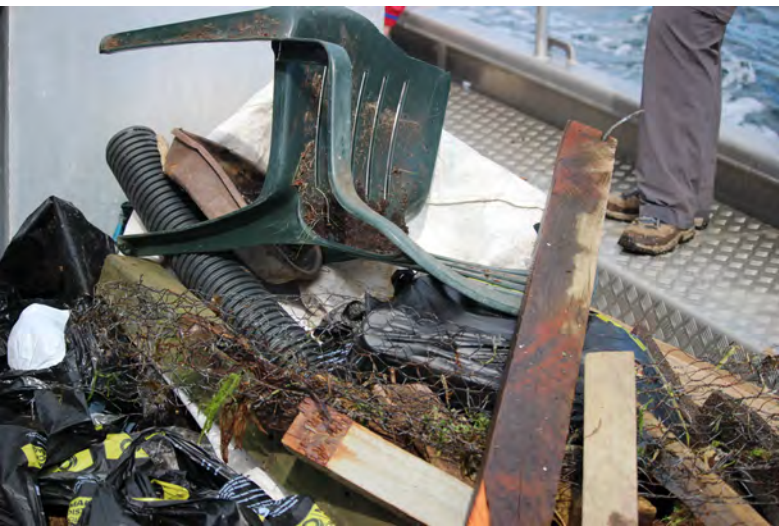
Above: Some of the rubbish collected