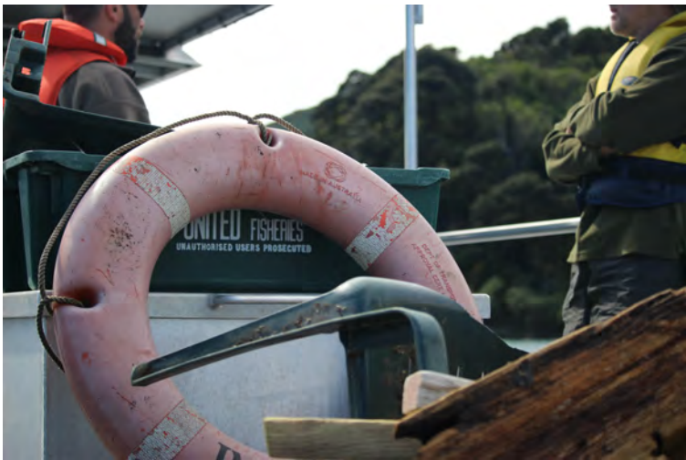
Above: Some of the rubbish collected

We could all agree the most ironic and unexpected findings included; a door covered with the saying “Save the Oceans”; a United Fisheries Fish Bin, 4 unopened cans of ‘Export Gold’ dating back to 2006, a life ring from Sydney and a fishing rod. As surprising as these findings were, they are only a grain of sand compared to the bulk of the rubbish we collected. Polystyrene, plastic bags, cans, filled rubbish bags, plastic packaging and masses of treated timber contributed to the bulk of our findings and our team easily found kilograms of rubbish on each beach.