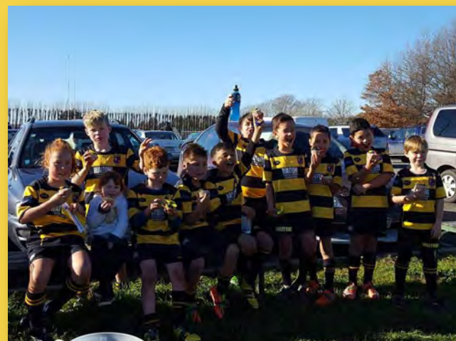
Under 9s eating there Waitohi black and yellow cupcakes celebrating their win!!