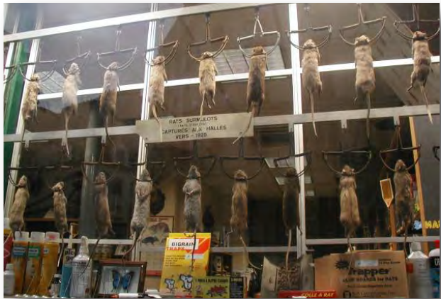
Aurouze shop front in Paris

It turns out that Picton isn't the first place to have a shop dedicated to rat trapping. Far from it – Julien Aurouze & Co in Paris has been selling pest control items from its macabre shop since 1872 and "specialise de la deratisation" is their tag line. We promise we won't fill our shop front with stuffed, dead rats to follow their example. At the end of the day we are here to protect the birds and we hope you too will join our growing group effort.