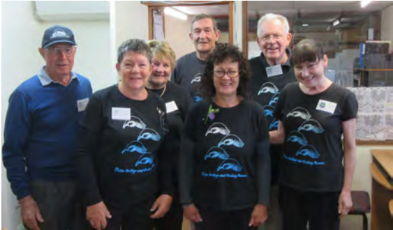
Staff and committee members ready to welcome visitors on a recent cruise ship day