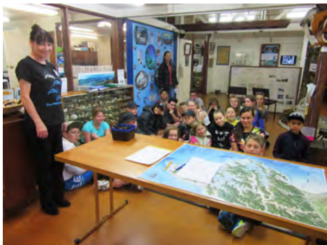
A recent visit from Riverlands School

PICTON HERITAGE & WHALING MUSEUM welcomes visitors, groups or individuals Phone 573-8283 or call in at 9 London Quay